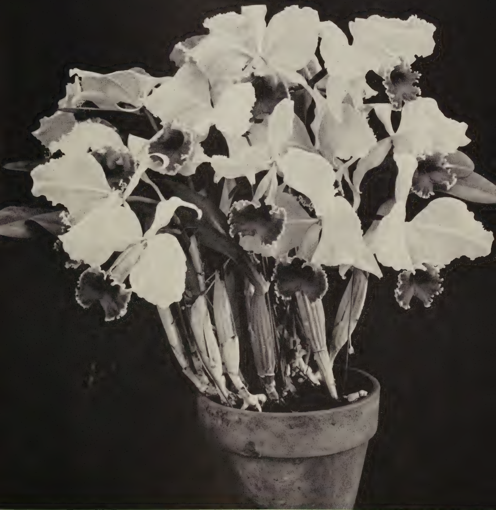
Cattleya Trimos Cross No. 1031